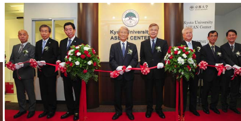
Opening Ceremony, June 26 th , 2014, Bangkok